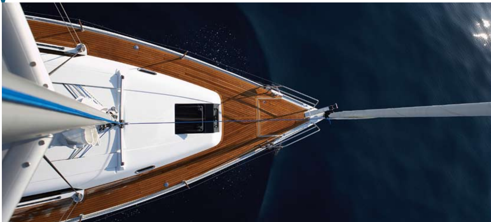
Design judel / vrolijk & co